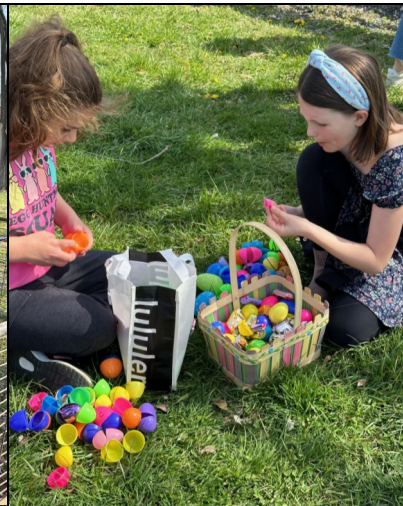
Top left photo: this year's Easter Egg Hunt also included a Petting Zoo, with the kids petting the kids! And chicks! And bunnies! Top right photo: these youngsters scored a big basketful of Easter Eggs!