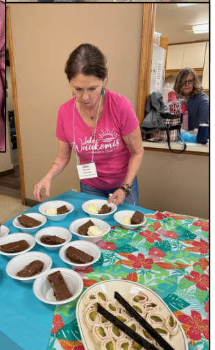
Candid photos from the April Women's Club meeting and Scavenger Hunt.

Clues for the Scavenger Hunt had the ladies looking for the cherubs, seeking a bear in a tree, pretending to play pickleball, and more. Fortification with the Drinkmaster's rum daiquiris helped (hindered?) the teams as they raced around the lake on their golf carts. See the front page of the NEWS for the Scavenger Hunt's winning team.