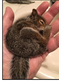
Waukomis has a lot of wildlife. Pay attention and you might enjoy a good show.

Walking several miles every day around Waukomis is one of my great pleasures. Over the past several months, I've observed unusual and sometimes amusing wildlife activities.